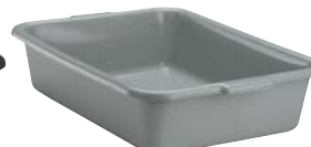
Deluxe 5" Bus Box - Bulk No. 1521B-31, Gray H5 L20 W15 *150 pcs./590# • 46.51 cu.ft.