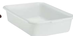
Deluxe 5" Bus Box No. 1521-05, White H5 L20 W15 12 pcs./32# • 2.79 cu.ft.