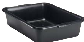
Budget 5" Bus Box - Bulk No. 1520B-06, Black H5 L20 W15 *300 pcs./435# • 31.18 cu.ft.