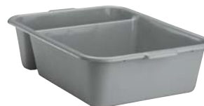
Divided Bus Box No. 1721-31, Gray H6¾ L22¾ W17¾ 12 pcs./33# • 3.23 cu.ft.