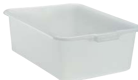
Standard 7" Deep Bus Box - Bulk No. 1527B-05, White H7 L20 W15 *150 pcs./575# • 54.65 cu.ft.