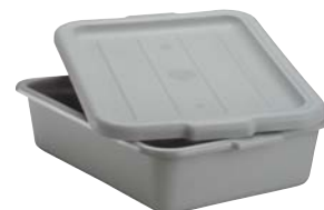
Bus Box Cover No. 1522-31, Gray L20 W15 12 pcs./16# • 1.97 cu.ft.