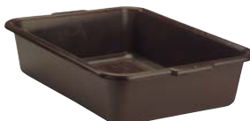
Budget 5" Bus Box No. 1520-01, Chocolate H5 L20 W15 24 pcs./35# • 3.19 cu.ft.