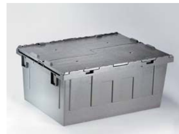
Storage/Transport Unit No. 7521-21P H12½ L27¾ W20½