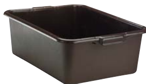
Standard 7" Deep Bus Box No. 1527-01, Chocolate H7 L20 W15 12 pcs./29# • 3.84 cu.ft.