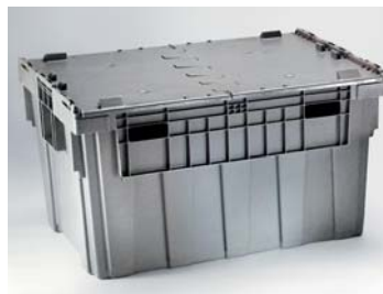
Storage/Transport Unit No. UP 1000P H24 L34 W21½

Extend the life of your chafing dish with stackable Storage/Transport Units.