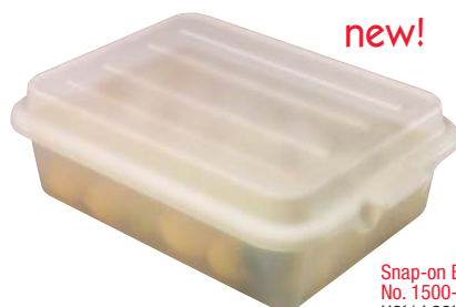
Snap-on Bus Box Lid No. 1500-C13, Clear H2½ L22¾ W15¾ 6 pcs./8# • 1.00 cu.ft. Fits: 1520, 1521, 1527