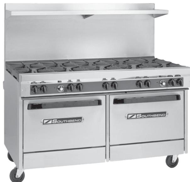
(shown with optional casters)

Exterior Finish: Stainless steel front, sides and shelf standard.