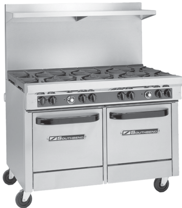
(448EE shown with optional casters)

Exterior Finish: Stainless steel front, sides and shelf standard.