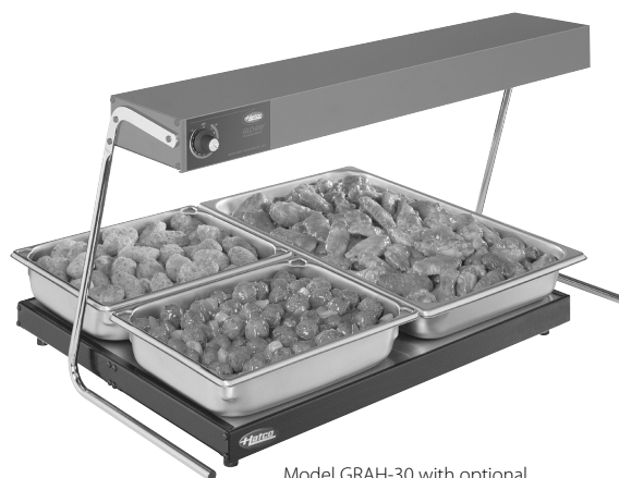
Model GRAH-30 with optional Designer color and infinite switch and accessory C-Leg stand over Heated Shelf model GRS-24-I in optional Designer color

BLANKET ELEMENTS GUARANTEED AGAINST BURNOUT AND BREAKAGE FOR ONE YEAR.