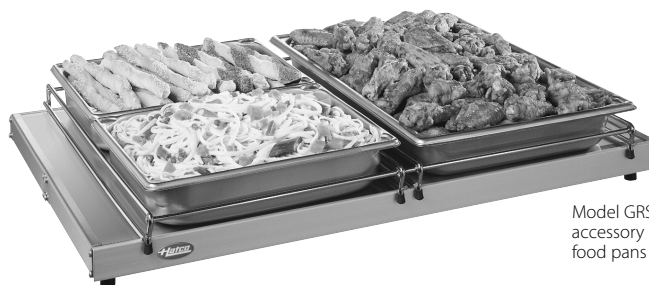
Model GRS-30-I with accessory pan rail and food pans