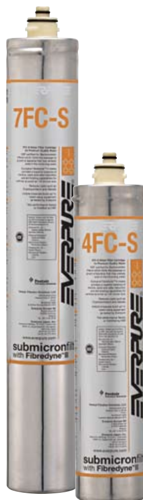
4FC-S Replacement Cartridge: EV9692-31

Always flush the filter cartridge at time of installation and cartridge change.