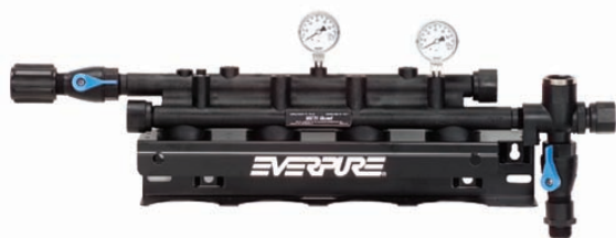
QC7I Quad Parallel Head: EV9336-11

Filter head exclusively for Everpure replacement cartridges