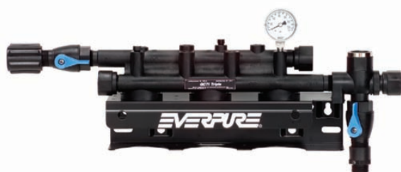
QC7I Triple Parallel Head: EV9272-23

Filter head exclusively for Everpure replacement cartridges