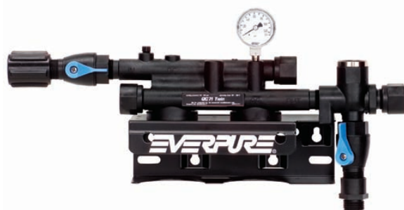
QC7I Twin Parallel Head: EV9272-22

Engineered for durability, strength and longevity. Will not corrode